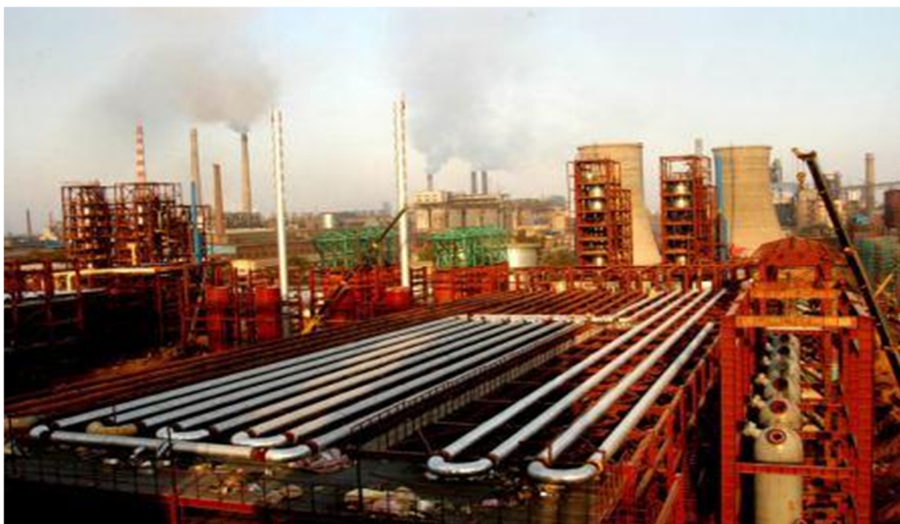
Figure 3. Tube Preheating and Autoclave Digestion in Chalco's Henan Refinery.

preheating for diasporic bauxite. The indirect preheating and high productivity digestion process for Chinese diasporic bauxites was a very important step for its energy savings. A great effort was made for the deployment of this technology in China in the 1980s and 1990s. The indirect preheating technology from Pechiney was introduced and successfully applied firstly in Shanxi refinery and then in Pingguo refinery in the 1990s.