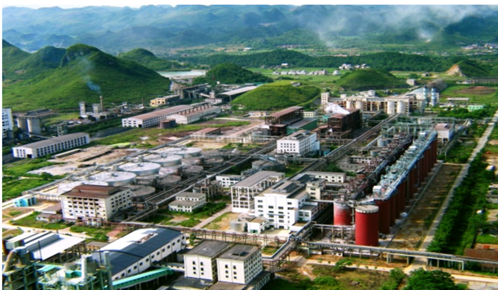
Figure 4. Bayer Process in Chalco's Pingguo Refinery, Guangxi.

In the meantime, tube digestion equipment was introduced from VAW by the Zhengzhou refinery in the 1990s but the industrial tests for this equipment were unsuccessful at the time. Consequently the Zhengzhou refinery (presently the Henan refinery) applied the tube preheating & autoclave retention tank digestion technology developed by Zhengzhou Light Metal Research Institute and successfully put it into operation.