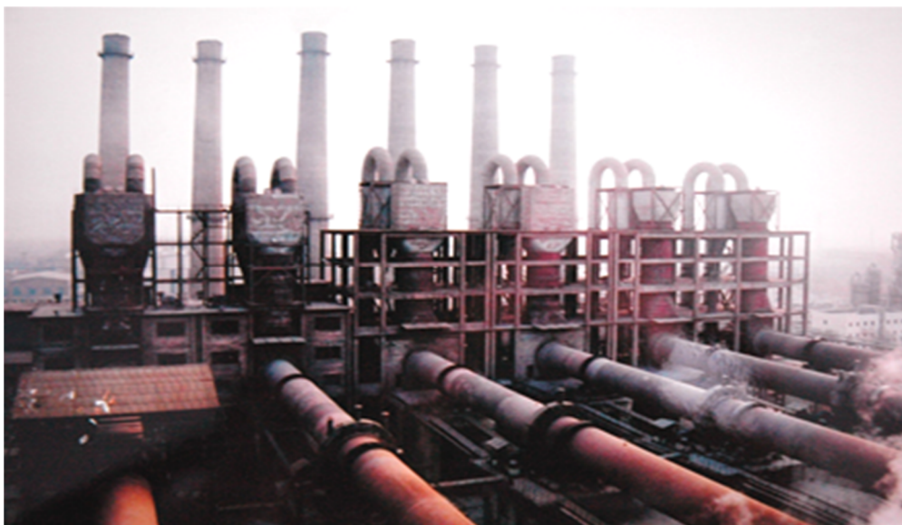
Figure 1. Sinter Process in Chalco's Shandong Refinery.

The Chinese alumina industry has undergone three development stages in the past 63 years.