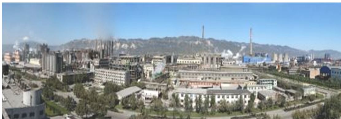
Figure 2. Bayer-Sinter Combined Process in the Chalco's Shanxi Refinery.

High temperature digestion technology with direct steam injection into digesters was introduced from Russia in the 1950s, and this kind of Bayer process for Chinese diasporic bauxite was first applied in the Zhengzhou refinery in Henan. This technology had high energy consumption due to the direct steam heating. As mentioned above, the Bayer-Sinter combined process was developed in the 1960s, in which both bauxite residue from the Bayer process and low-grade bauxite were mixed with soda ash and limestone and fed into a sintering kiln. The Bayer-Sinter combined process was widely applied in many refineries such as in Henan, Shanxi and Guizhou and became the major refining process in China from the 1970s until the 1990s.